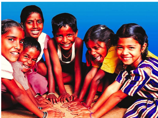
Global Initiative for Cancer